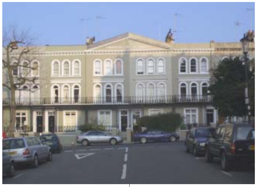
Fig 2: Kensington Park Terrace North

storey stuccoed houses with pretty first-floor wrought iron balconies is suitably articulated with its centre emphasised with a pediment on the axis of Arundel Gardens. Many years ago this terrace, the centre part of which is listed, was made the subject of an Article 4 Directive on the colours to be used. These were suitably varied to respond to the articulation of the terrace, but uniform enough to maintain its unity. The scheme worked well at first, but unfortunately over the years it has largely broken down due to lack of vigilance, much to the detriment of the appearance of the terrace. The central pediment, which covers two houses, even has been painted two different colours!