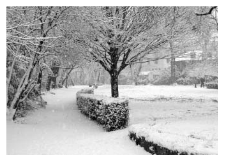
Fig 1: Blenheim and Elgin Crescents Garden in Winter

Garden Archive seems a grand misnomer for a collection of battered cardboard boxes and folders. Until 2000 this miscellaneous collection migrated round the Garden as the membership of the Garden Committee changed. It was only the discovery that the local history department in Kensington and Chelsea Library would store such material that caused a change in approach at the AGM of that year. It was decided to gather together all the available material to see whether anything of interest would emerge before depositing it in the Library.