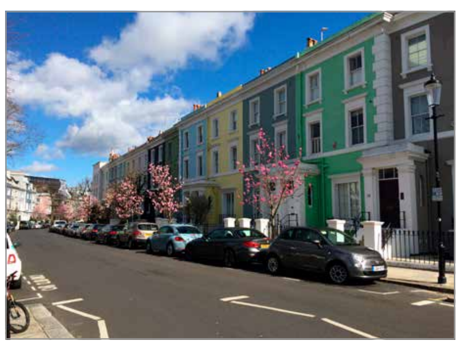
Magnolia trees in Elgin Crescent