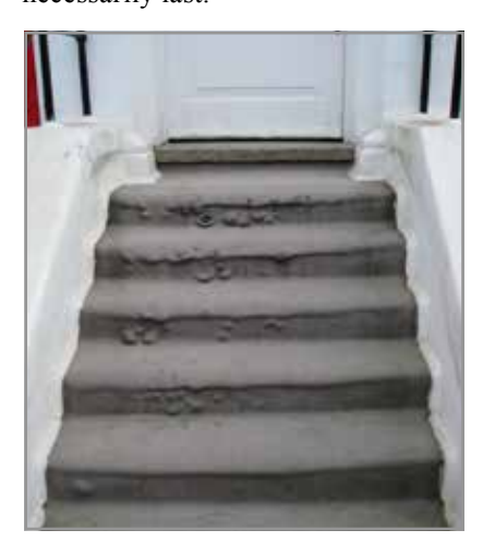
Drooping asphalt steps

The traditional Ladbroke estate house has steps up to its front door, originally paved, we believe, with stone slabs or, from the 1850s often with tiles. The gaps between paving stones or tiles mean that they are not really waterproof, and the rain tends to drip down to the cellar below now often transformed into a utility room, entrance hall to a basement flat or other living area. One of the most efficient methods of waterproofing the steps in such circumstances is to cover them with a coat of asphalt or bitumen. It looks quite good after it has been applied, being smooth and dark grey. But this does not necessarily last.