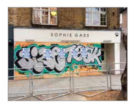
Graffito (with additional posters) that appeared overnight outside 4 Ladbroke Grove, Carnival 2018

Fortunately, we are not too plagued by graffiti in our area. The only major problems are in the Portobello area and round Ladbroke Grove Underground Station. But during carnival, graffiti artists do venture further south and west, especially where residents and shops have put up hoardings to protect their properties.