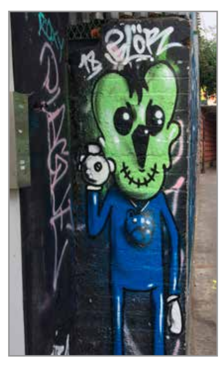
Somebody has taken real trouble over this one, rather spoiled by scrawled tags.

The most common form of graffiti are "tags" or stylised signatures. Sometimes these are just scrawls, but they can be very large and elaborate, like the one in the photo of 4 Ladbroke Grove at the top of this article. The