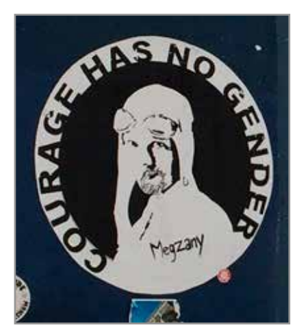
A "political" stencil graffito

The question of whether graffiti are art or vandalism is now hotly debated. Today's graffiti can be roughly divided into a number of categories. There are those that are intended or perceived as genuine works of art or to convey a political message, which tend to be few and far between in our area, although the two below from Portobello Road last year might be said to have pretensions. The more complex ones are known as "pieces", short for masterpieces.