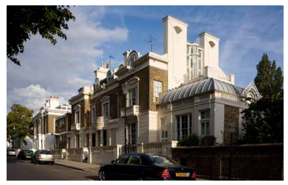
19 Lansdowne Walk

No. 19 is the end one of a trio of half stucco villas built in the 1840s. It was acquired in 1978 by Charles Jencks, the distinguished architectural historian and cultural theorist who has been extremely influential in fostering the post-modernist movement. Together with the architect Terry Farrell, between 1979 and 1985 he completely transformed the interior with a mass of fascinating décor and symbolism (difficult to describe in a few lines but there are pictures on the internet); and built an interesting extension on the flank of the house,