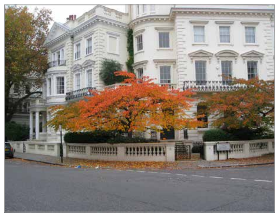
Autumn colour: trees in Stanley Gardens in 2017