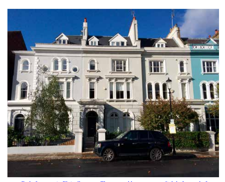
End of terrace in Elgin Crescent. The two end house are set slightly forward of and have different windows from the mid-terrace houses. This is replicated at the other end of the terrace.

We suspect that it is not always clear to applicants that our terraces have a symmetrical design. In one looks carefully at almost any terrace on the Ladbroke estate, it can be discerned