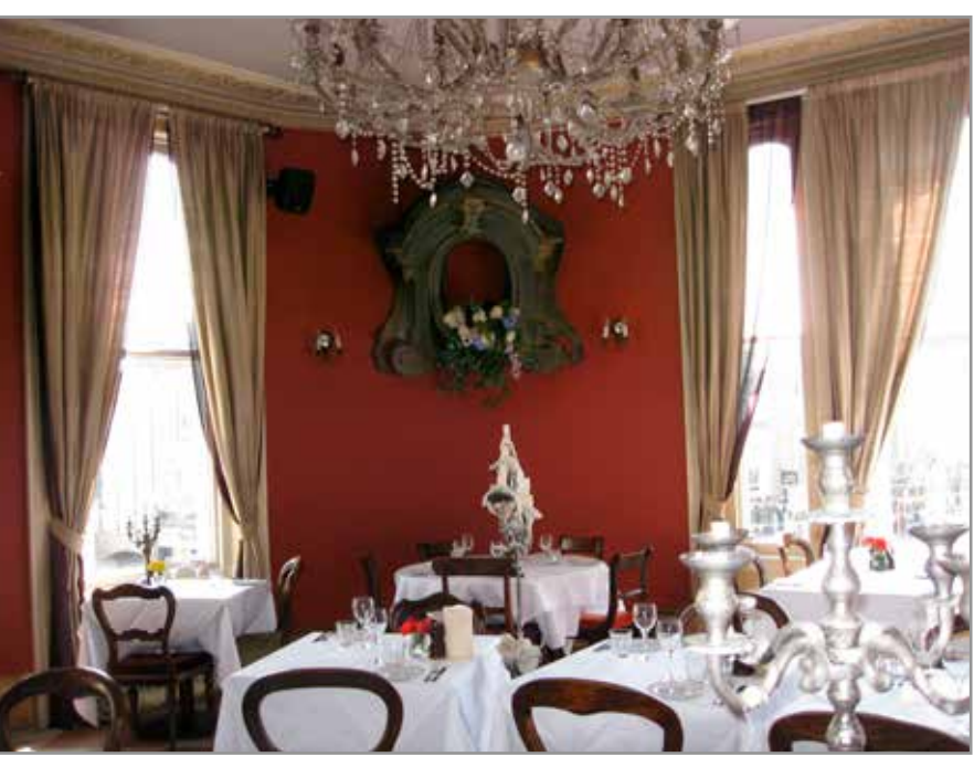
The magnificent Victorian dining room

Unfortunately, there was nothing to stop them from doing what they have done as the building was not listed and therefore the interior was unprotected. When the First Floor restaurant closed, there was talk of the pub being turned into offices or an