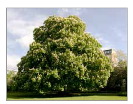
Horse chestnut in Ladbroke Square

creating problems and there are some truly magnificent specimens like the horse chestnut below in Ladbroke Square. But private gardens also have some fine trees which greatly add to the amenity of the area as well as being the pride of their owners. Tourists now come in spring for instance, to look at the many magnolias in our front gardens, which show to magical effect against the stucco. We were delighted, therefore, when the new owners of No. 113 Elgin Crescent, who originally sought to fell the magnificent but rather overbearing magnolia in their front garden, decided to go for pruning instead. Magnolia roots are sensitive to disturbance, but above ground the trees accept considerable pruning without harm so long as it is done professionally.