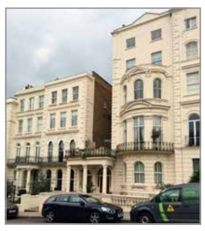
64, 66 and 68 Ladbroke Grove

To begin with, he was highly successful,