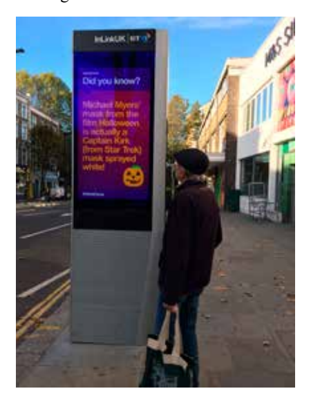
New unit outside M&S

BT is applying to put a network of a new sort of public phone box up all over the borough, called InLinkUK. "Box" is a misnomer; they are more pillars or columns - see photo below of one already installed outside the Oxfam shop in Notting Hill Gate.